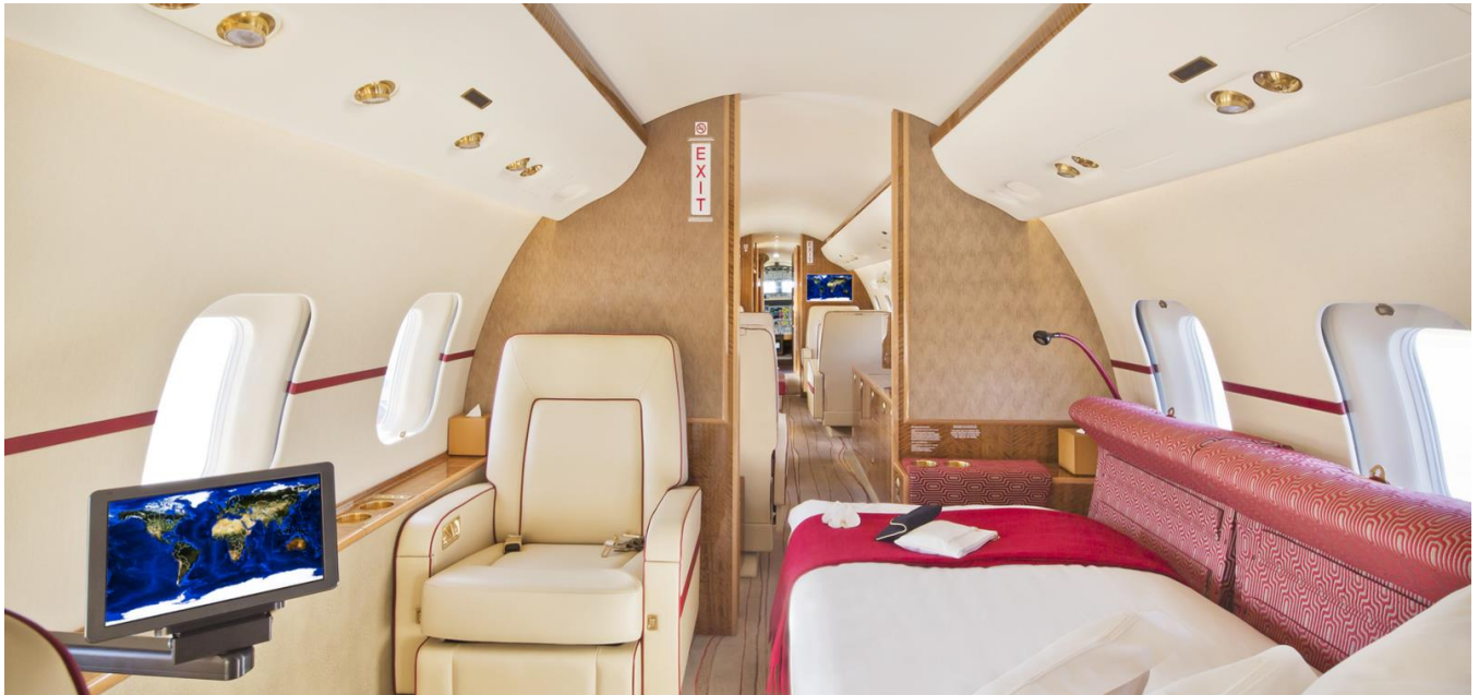
Aft area prepared as a sleeping area

Available Immediately for Sale – Financing Available – Some Trades Considered