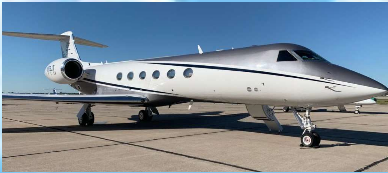
New Paint in September 2019 by Duncan Aviation

The aircraft specifications and information has been obtained from the aircraft owner and it is believed this information is reasonably accurate. The information and specifications are offered for marketing purposes only. All information and all specifications regarding the aircraft is the sole responsibility of the purchaser or lessee to verify and to satisfy themselves as to the reliability and accuracy of all information. No representations or guarantees as to the information, specifications, qualifications or certification for any use or performance of the aircraft are made by CCI.