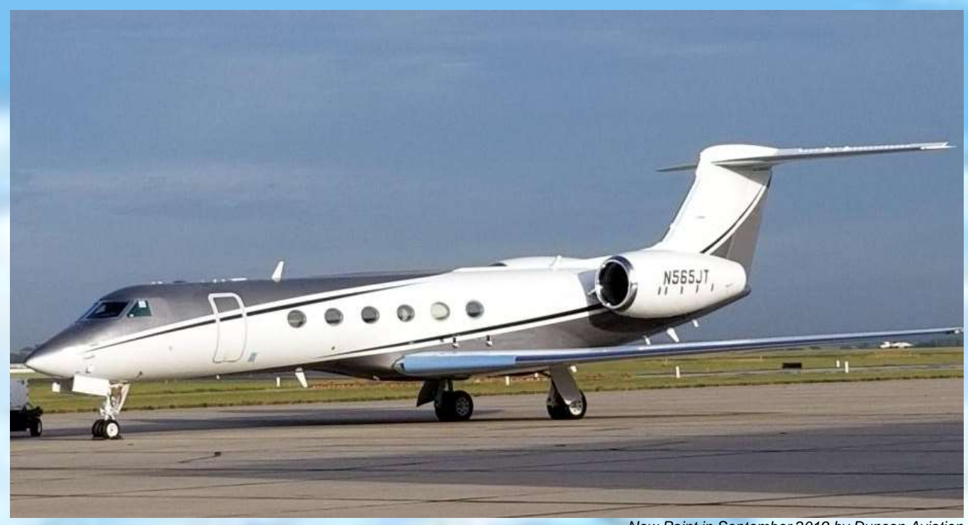
New Paint in September 2019 by Duncan Aviation