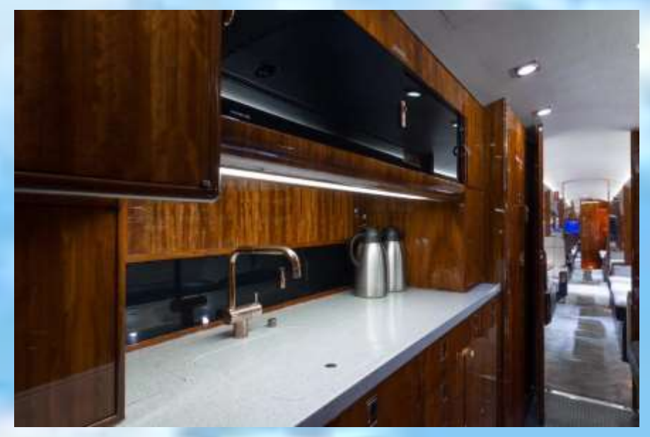
Interior Refurbishment in August 2017

This aircraft is configured for seventeen passengers just completed refurbishment in August 2017. The interior is configured with a three-place divan opposite the galley in the far forward compartment, a four-place club group with fold-out tables in the forward cabin, a four-place club group in the mid cabin and two three-place divans opposite each other in aft cabin. Forward and aft lavatories and a fully equipped forward galley complete the VIP executive interior. For long range trips overseas there are Jetrest Skylounger mattresses for