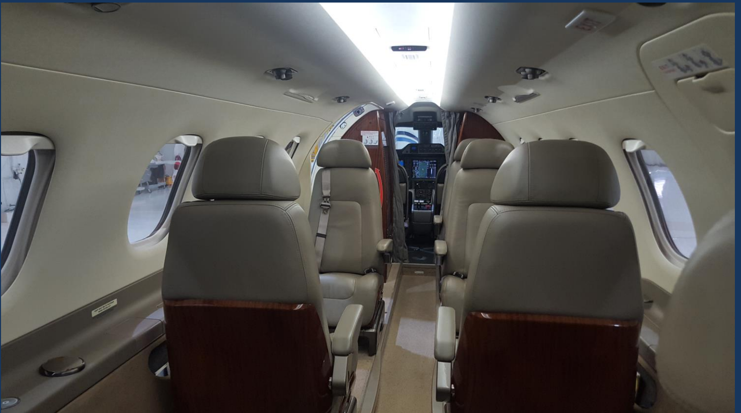
Cabin – Forward Facing