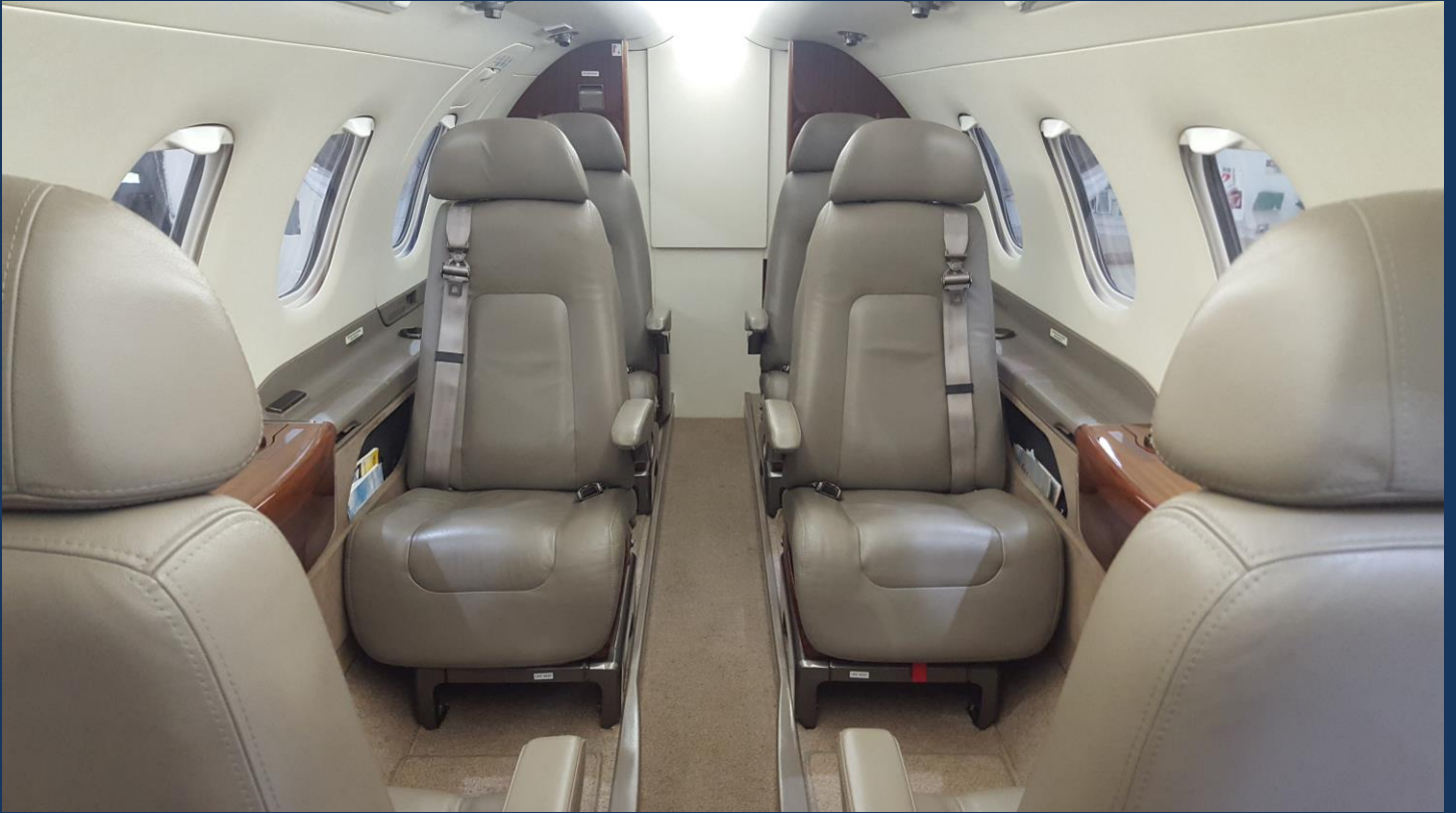
Cabin – Aft Facing