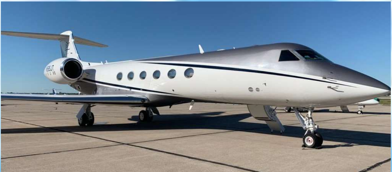
New Paint in September 2019 by Duncan Aviation

The aircraft specifications and information has been obtained from the aircraft owner and it is believed this information is reasonably accurate. The information and specifications are offered for marketing purposes only. All information and all specifications regarding the aircraft is the sole responsibility of the purchaser or lessee to verify and to satisfy themselves as to the reliability and accuracy of all information. No representations or guarantees as to the information, specifications, qualifications or certification for any use or performance of the aircraft are made by CCI.