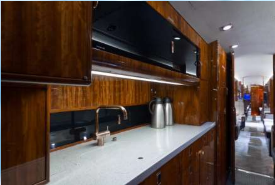
Interior Refurbishment in August 2017

This aircraft is configured for seventeen passengers just completed refurbishment in August 2017. The interior is configured with a three-place divan opposite the galley in the far forward compartment, a four-place club group with fold-out tables in the forward cabin, a four-place club group in the mid cabin and two three-place divans opposite each other in aft cabin. Forward and aft lavatories and a fully equipped forward galley complete the VIP executive interior. For long range trips overseas there are Jetrest Skylounge mattresses for the club seat groups and the divans are berthable.