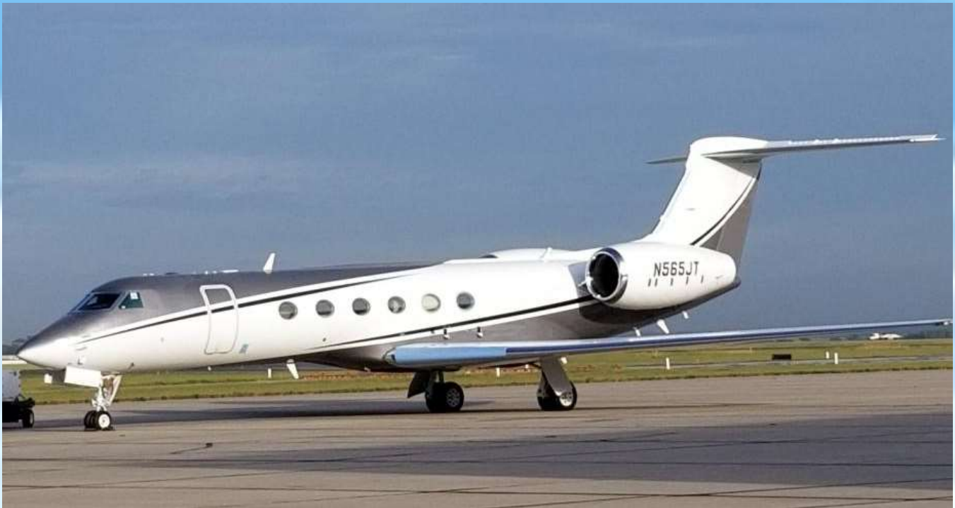
New Paint in September 2019 by Duncan Aviation