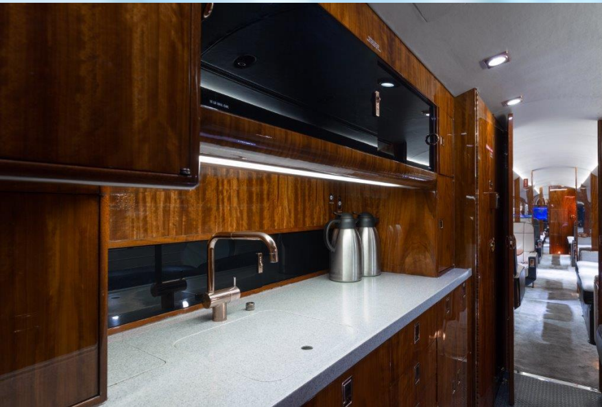
Interior Refurbishment in August 2017

This aircraft is configured for seventeen passengers just completed refurbishment in August 2017. The interior is configured with a three-place divan opposite the galley in the far forward compartment, a four-place club group with fold-out tables in the forward cabin, a four-place club group in the mid cabin and two three-place divans opposite each other in aft cabin. Forward and aft lavatories and a fully equipped forward galley complete the VIP executive interior. For long range trips overseas there are Jetrest Skylounge mattresses for the club seat groups and the divans are berthable.