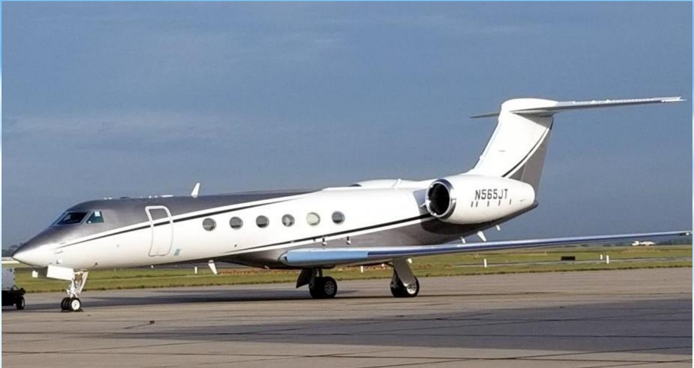
New Paint in September 2019 by Duncan Aviation