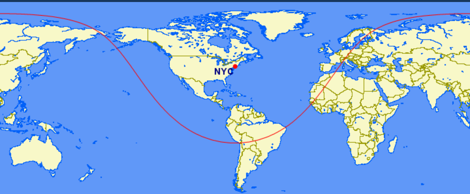
Range from New York